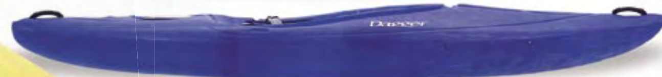
APPROACH 10.0 Length: 10' • Width: 28" • Weight: 44 lbs. Maximum Load: 330 lbs. Cockpit: 38.75x21.25" Deck Height: 13.5"