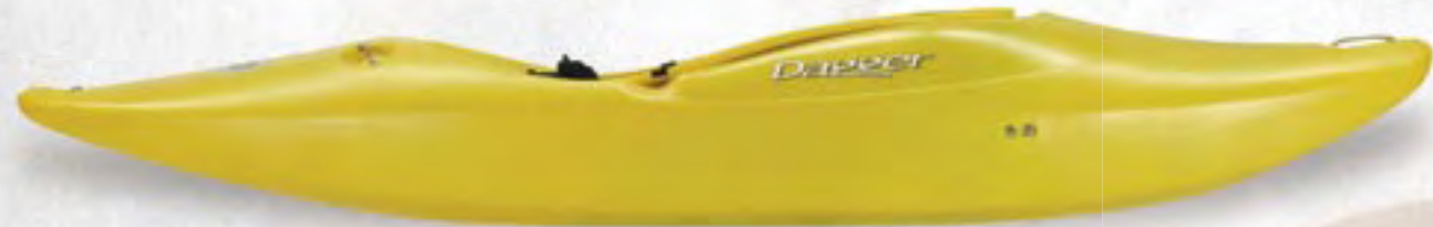
MAMBA 8.0 Length: 8' • Width: 26" • Weight: 42 lbs. Volume: 62 gal. • Paddler Weight Range: 150-215 lbs. Cockpit: 34x19" • Deck Height: 13.75"