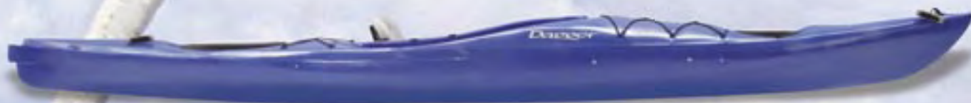
CATALYST 13.0 Length: 13" • Width: 26.5" Weight: 51 lbs. • Maximum Load: 295 lbs. Cockpit: 38x21" • Deck Height: 12" Storage Capacity (bow/stern): 3050/4300in 3