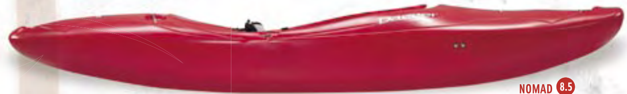
NOMAD 8.5 Length: 8' 5" • Width: 26.5" • Weight: 45 lbs. Volume: 78 gal. • Paddler Weight Range: 150-240 lbs. Cockpit: 34x19" • Deck Height: 13"