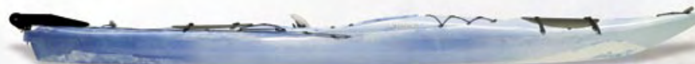
SPECTER 14.0 Length: 14'2" • Width: 24.25" Weight: 58 lbs. • Maximum Load: 285 lbs. Cockpit: 34x19" • Deck Height: 13.75" Storage Capacity (bow/stern): 1750/6100in 3