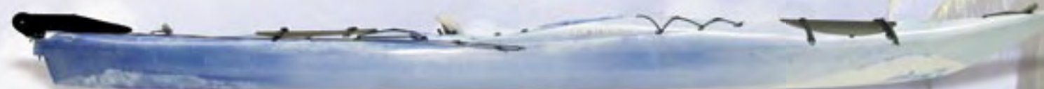
SPECTER™ 15.0 Length: 15'2" • Width: 24.75" Weight: 59 lbs. • Maximum Load: 320 lbs. Cockpit: 34x19" • Deck Height: 13.75" Storage Capacity (bow/stern): 2050/6550in 3