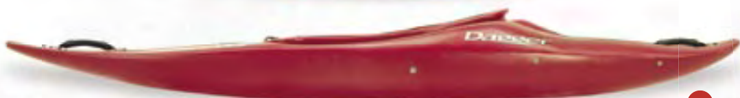
DYNAMO 7.4 Length: 7'4" • Width: 21" Weight: 27 lbs. • Maximum Load: 135 lbs. Cockpit: 30x17" • Deck Height: 10.5"