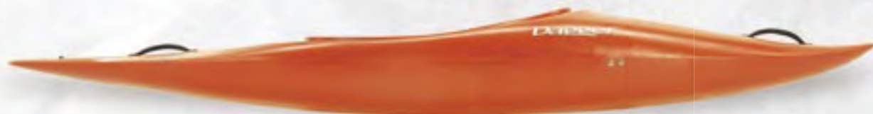
RPM 9.0 Length: 8'11" • Width: 24" • Weight: 39 lbs. Volume: 60 gal. • Paddler Weight Range: 110-230 lbs. Cockpit: 34x19" • Deck Height: 12"