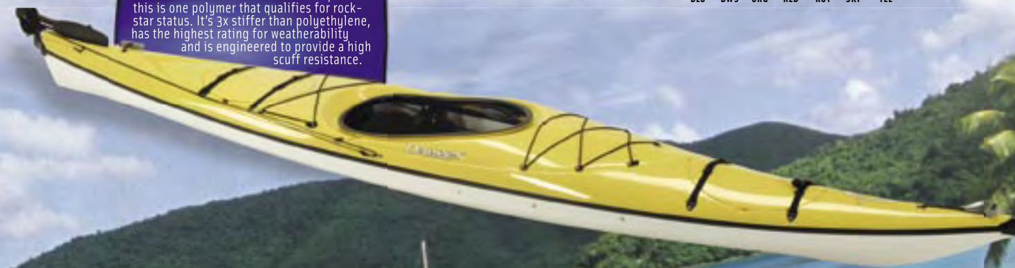
SPECTER™ 15.5 AIRLITE Length: 15'3" • Width: 24.75" Weight: 55 lbs. • Maximum Load: 320 lbs. Cockpit: 34x19" • Deck Height: 13" Storage Capacity: 2100/6550in 3

Airlite 15.5 • Airlite™ came about in our constant search for better materials, and this is one polymer that qualifies for rock-star status. It's 3x stiffer than polyethylene, has the highest rating for weatherability and is engineered to provide a high scuff resistance.