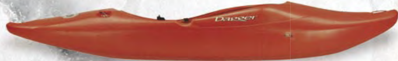
MAMBA 8.5 Length: 8' 5" • Width: 27.75" • Weight: 46 lbs. Volume: 72 gal. • Paddler Weight Range: 175-260 lbs. Cockpit: 34x19" • Deck Height: 15"