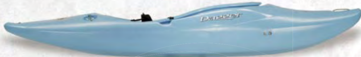
MAMBA 7.5 Length: 7'7" • Width: 25.25" • Weight: 37 lbs. Volume: 57 gal. • Paddler Weight Range: 120-170 lbs. Cockpit: 34x19" • Deck Height: 13.5"