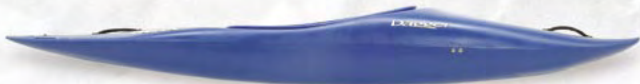
RPM Max 9.1 Length: 9'2" • Width: 25.75" • Weight: 41 lbs. Volume: 75 gal. • Paddler Weight Range: 175-280 lbs. Cockpit: 34x19" • Deck Height: 12.25"