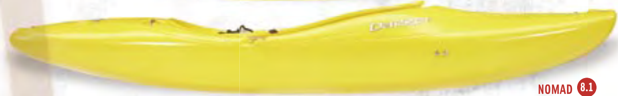
NOMAD 8.1 Length: 8' • Width: 25.25" • Weight: 42 lbs. Volume: 68 gal. • Paddler Weight Range: 110-190 lbs. Cockpit: 34x19" • Deck Height: 12.5"